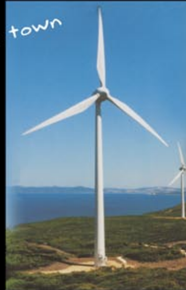
Wind Powered town Cool!