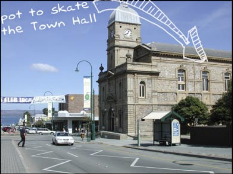
Good Spot to skate behind the Town Hall