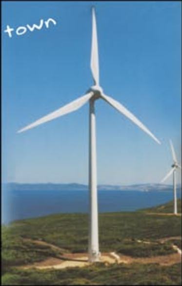
Wind Powered town Cool!