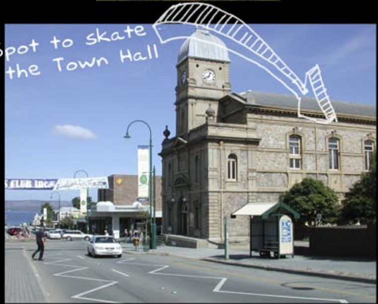
Good Spot to skate behind the Town Hall